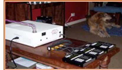
Jack undergoing treatment with the PERL.